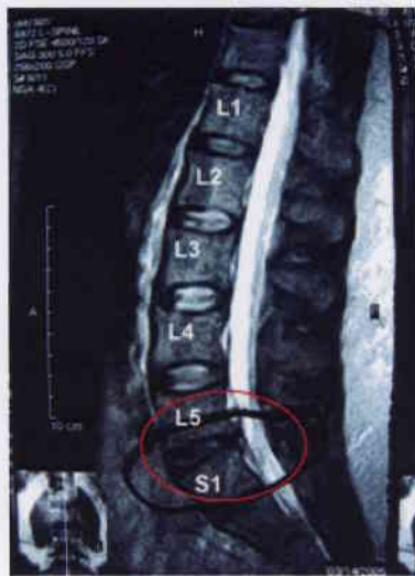
Figure 1b: Post-treatment MRI (03/14/05)