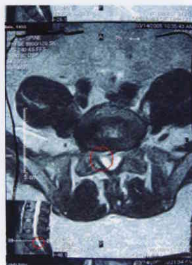
Figure 1d: Post-treatment MRI (03/14/05)

A 50-year-old male with herniated disc at L5-S1. Severe low back pain radiating down into the right leg with straight leg raise of 10° (on the right). Received IDD Therapy in February 2005 and by March 2005 the patient had straight leg raises of 90 degrees and no pain.