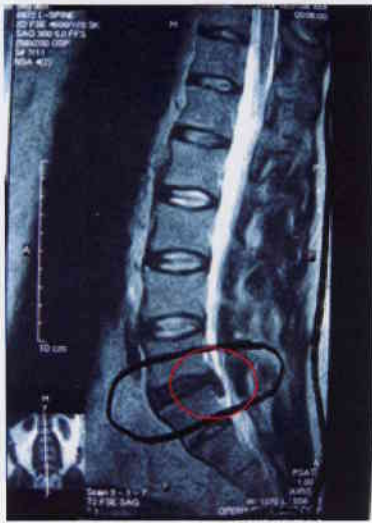
Figure 1a: Pre-treatment MRI (02/02/05)